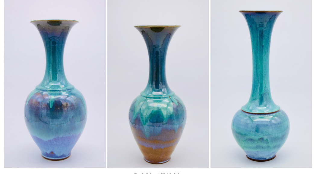
All works were newly created in 2020 for the New York show.